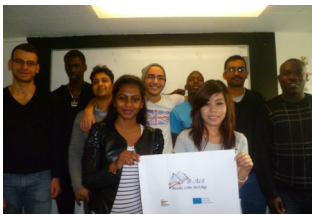
Traditional tales writing group ADPI ©

reading books for people with special needs: Pedagogical methods